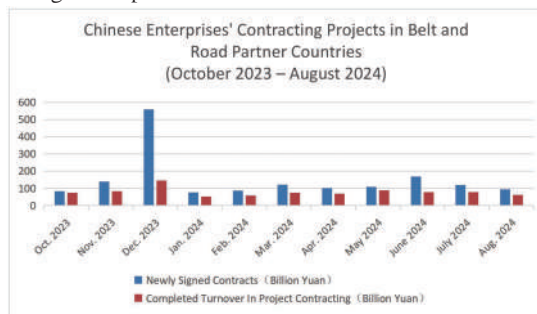
Figure 3: Contracting Projects by Chinese Enterprises in Belt and Road Partner Countries (October 2023 – August 2024) (Source: Ministry of Commerce)

On January 17, 2024, Chinese President Xi Jinping responded to a letter from Kenyan students and alumni representatives at Beijing Jiaotong University, encouraging them to continue contributing to the friendship between China, Kenya, and Africa. The Mombasa-Nairobi Railway, a flagship project and a successful model of China-Kenya cooperation under the Belt and Road Initiative, was designed to empower the Kenyan side to manage its operations. China has sponsored 100 Kenyan students to study railway operations and management at Beijing Jiaotong University. These students have since returned to Kenya, joining the Kenya Railways Corporation and becoming a new driving force for local development and enhanced bilateral cooperation. As of May 31, 2024, the Mombasa-Nairobi Railway had been in safe operation for seven years, transporting 12.86 million passengers and 32.87 million tons of cargo. It has directly and indirectly created 74,000 jobs in Kenya and trained over 2,800 highly qualified railway professionals and management personnel.