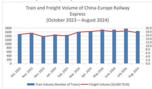
Figure 2: China-Europe Railway Express Train and Freight Volume (Since October 2023)